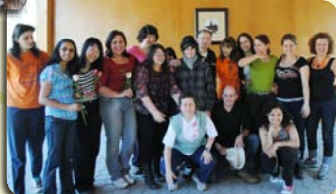
UK Pilgrims in Porto