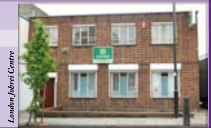
London Johrei Centre